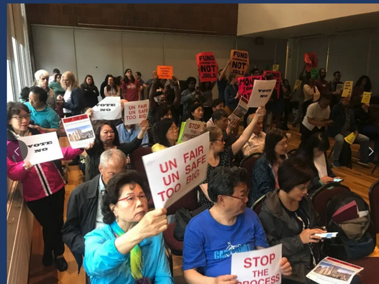
Community Board 1 voted against the city's jail plan for 125 White St. Tuesday.